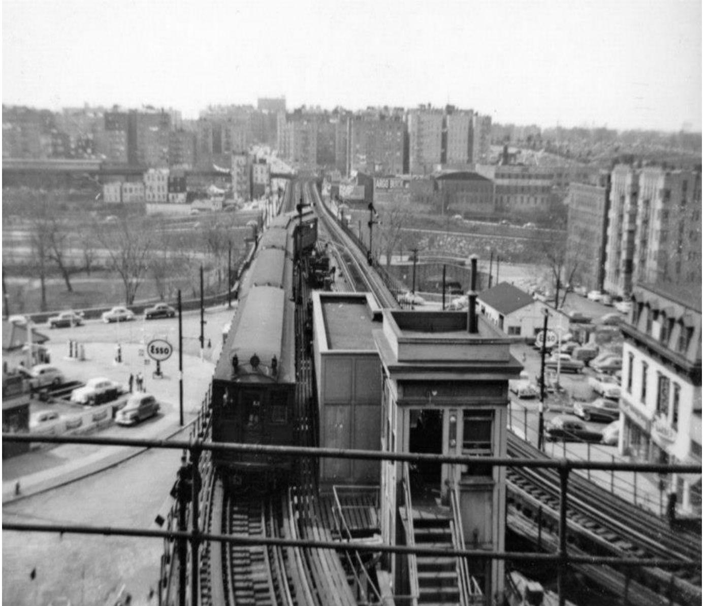
Third Avenue El – Gun Hill Road

stadium hosted 6,581 Yankees regular season home games during its 85-year history. It was also the former home of the New York Giants football team. The stadium's nickname, "The House That Ruth Built", is believed to be derived from Babe Ruth, the iconic baseball superstar whose prime years coincided with the stadium's opening and the beginning of the Yankees' winning history. In 2008 a new Stadium was constructed and the old one was not demolished until 2010.