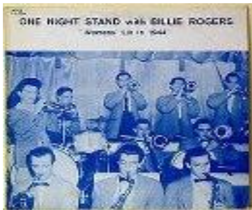
Pelham Heath Inn Orchestra featuring One Night Stand with Billie Rodgers 1944