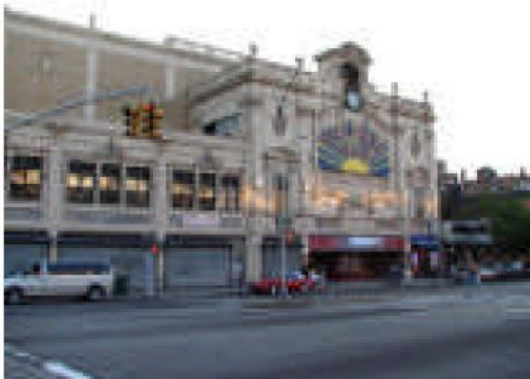
The Loews Paradise