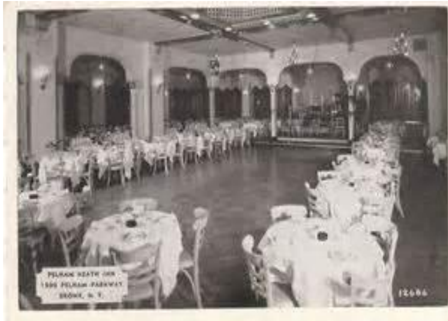
Inside of the Pelham Heath Inn.