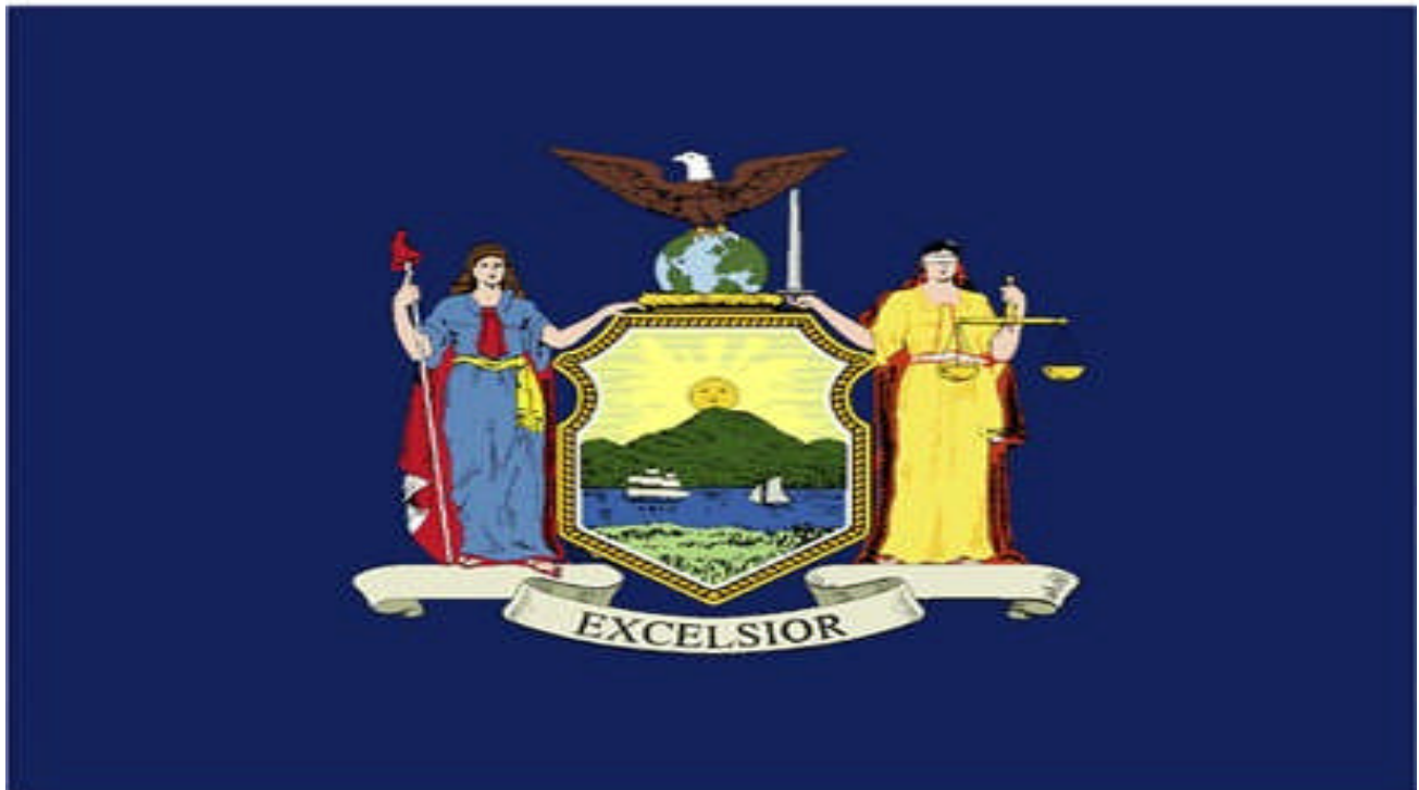
The Flag of the State of New York

For more information about the Bronx Club Of Vegas Valley, http://bronx.xadar.com