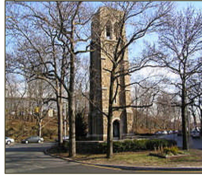
Bell Tower Park

One day, when I was around 7 years old, I was over the wall on the estate side collecting chestnuts that were lying on the ground. My pockets were bulging with nuts. Suddenly I heard a car horn. I looked up and saw a black Cadillac had stopped. The front window was down and the driver was calling me over. I obeyed, climbed over the wall, and walked up to the car. The rear window opened and Arturo Toscanini was looking at me. He said, in his heavy Italian accent, "Boy, what are you doing on my property?" I meekly answered that I was collecting chestnuts. When he asked why, I told him that my mother makes a very good chestnut pie. He said, "Okay, take the chestnuts home and ask your mother to make a pie and bring it to me tomorrow at 3:00 p.m."