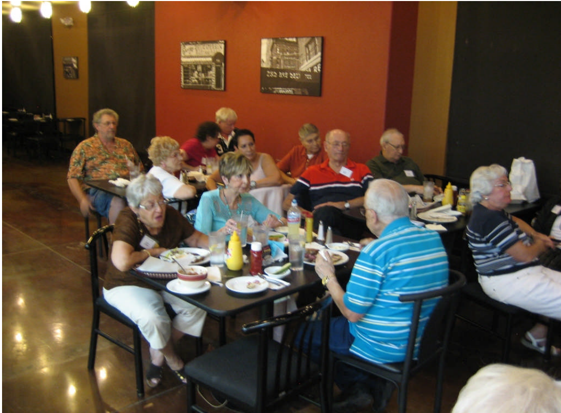
All had a delicious dinner.