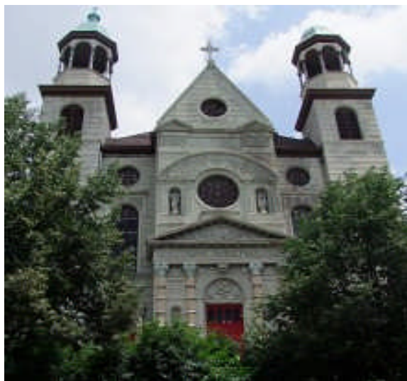
St. Augustine Church built 1895.

By the late 1860's it was generally assumed that the towns on the mainland would be annexed by New York City as it expanded northward. In 1868, Morrisania numbered its streets to make them conform to those of the city, and in the following year the municipal parks department was given control of the bridges over the Harlem River and the streets leading to them.