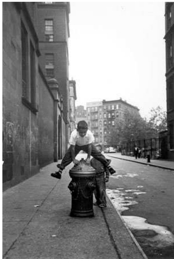
Leap Frog on a Bronx Street