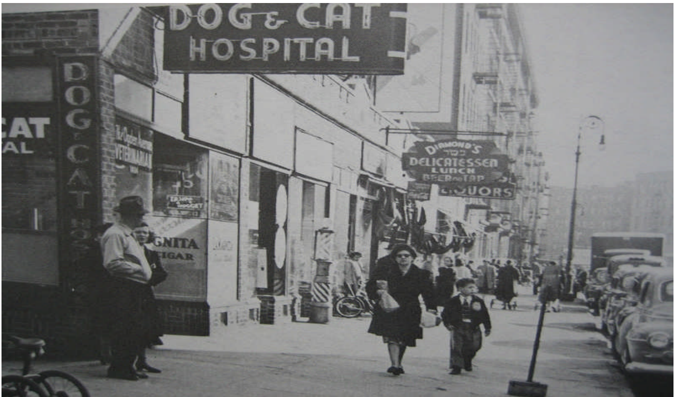
Located at the northern end of Highbridge's main street – can you name it?