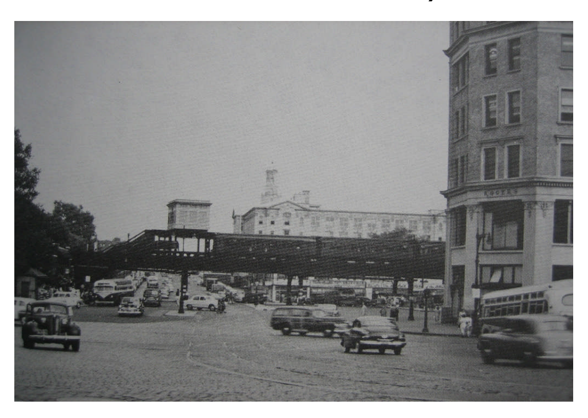
_____ .The year is? And, _ HS is in the background. -9-This is at _____