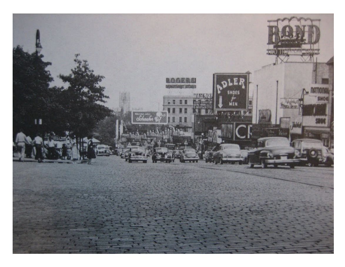
Where is this picture taken?