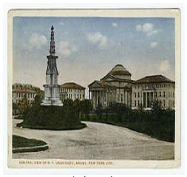
A general view of NYU The Bronx, New York.