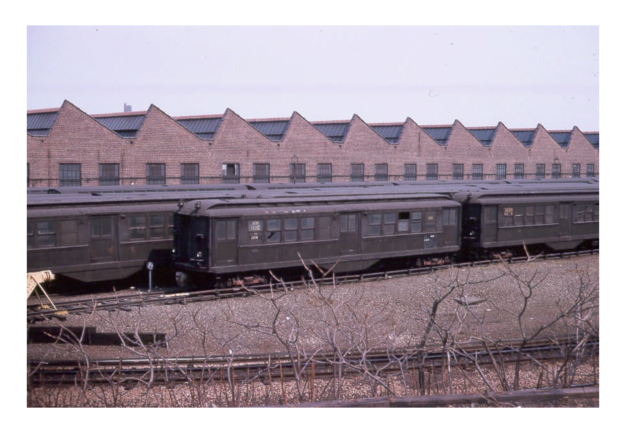
Westchester Train Yard June 1966