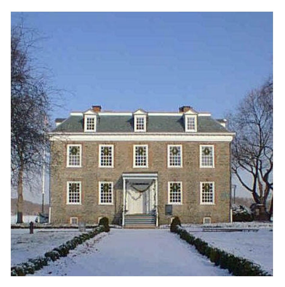
THE VAN COURTLAND HOUSE MUSEUM

The Van Cortlandt House Museum, also known as Frederick Van Cortlandt House or Van Cortlandt House, is the oldest building in The Bronx.