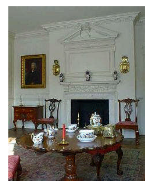
The East Parlor