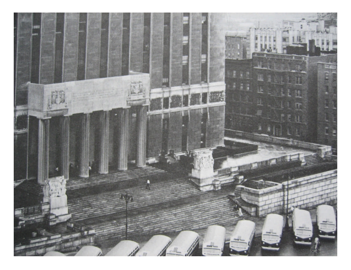
Where and what is this building?